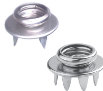
FPSNAP and 3050

Prong Clinch snaps are held in place by pushing the prongs through the mat and crimping them on the bottom of the mat.