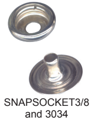
SNAPSOCKET3/8 and 3034

Socket snaps are held in place by crimping the tip of an eyelet through the center of the socket with a snap tool. This traps the mat between the socket on the top of the mat and the eyelet on the back of the mat. 10 sockets and eyelets are included in each pack.