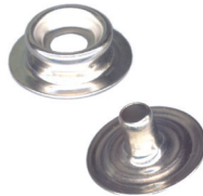
SNAPSTUD10 3/8 and 3033

Stud snaps are held in place by crimping the tip of an eyelet through the center of the stud with a snap tool. This traps the mat between the stud on the top of the mat and the eyelet on the back of the mat. 10 studs and eyelets are included in each pack.